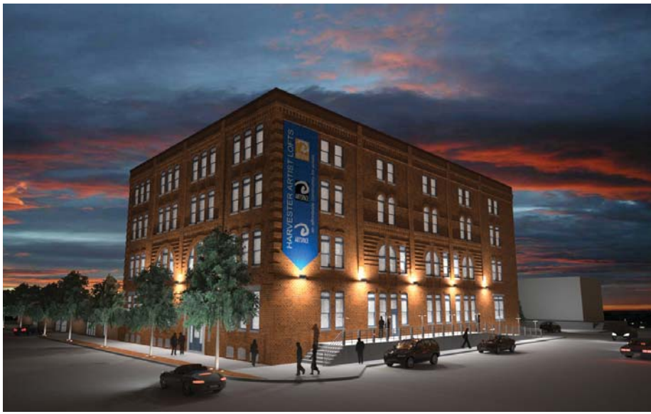
Submitted by Alley Poyner Macchietto Architecture